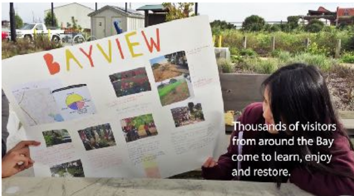
Thousands of visitors from around the Bay come to learn, enjoy and restore.

Today, Heron's Head Park attracts more than 100 migratory and resident bird species. In 1999, it was named Heron's Head Park for its resemblance - when viewed from the air - to one of its residents: the Great Blue Heron. The park welcomes thousands of visitors from around the Bay Area - who come to learn, enjoy, and restore in nature.